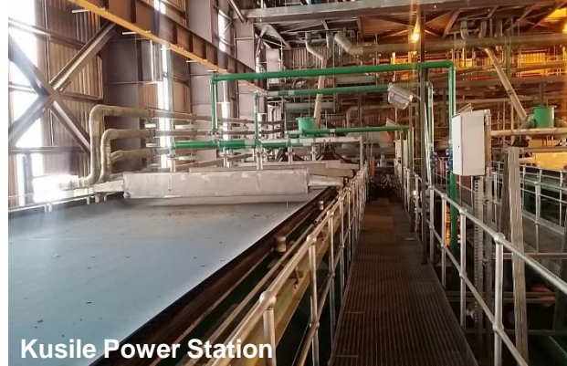
Kusile Power Station