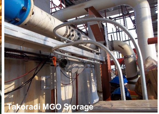
Takoradi MGO Storage