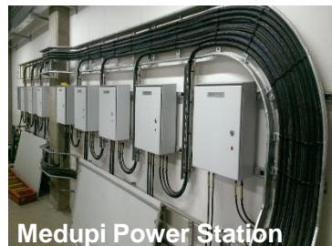
Medupi Power Station