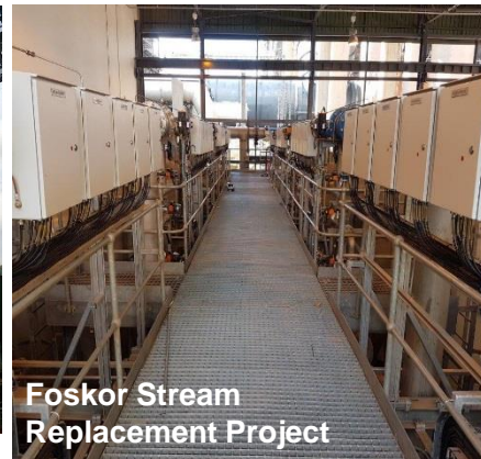
Foskor Stream Replacement Project