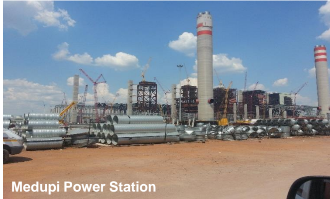
Medupi Power Station